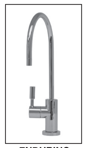
ENDURING HOT ONLY

Meets National Lead Laws including NSF 372 - 2011 Drinking Water System Components -Lead Content and S.3874, Reduction of Lead in Drinking Water Act, CA AB 1953 and VT Act 193.