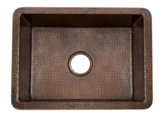
CPK278 Antique CPK578 Brushed Nickel