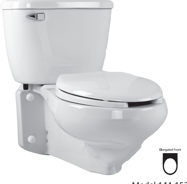
Model 144-153 Toilet seat shown is unavailable